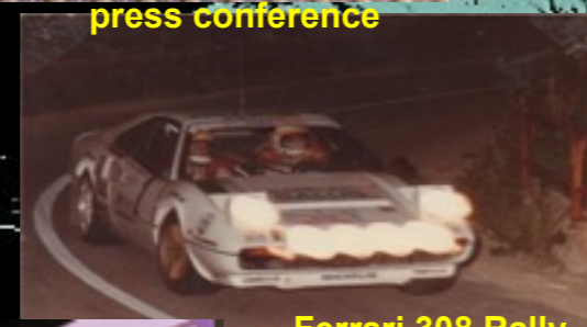
Ferrari 308 Rally