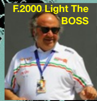
F.2000 Light The BOSS