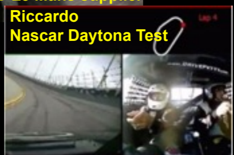
Riccardo Nascar Daytona Test