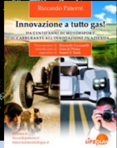
Our book on Innovation and Motorsport Management