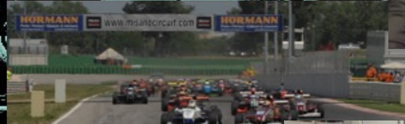
F.2000 Light series