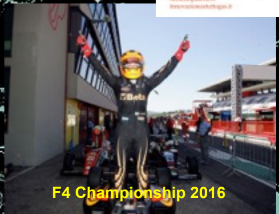
F4 Championship 2016