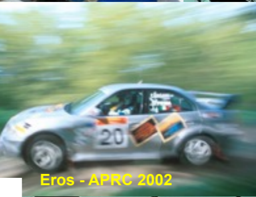
Eros - APRC 2002