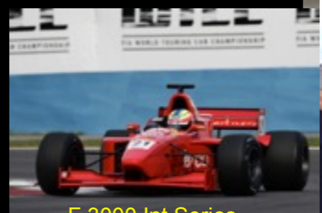
F 3000 Int. Series